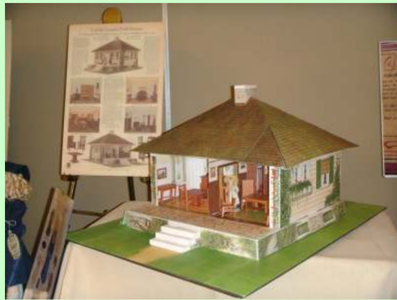
Kestner Daisy paper house - now is available again !!