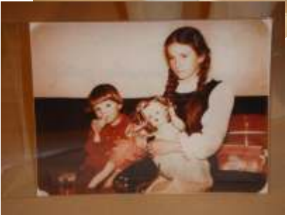
'Photographed at the United Federation of Doll Clubs, Inc. Annual Convention.'