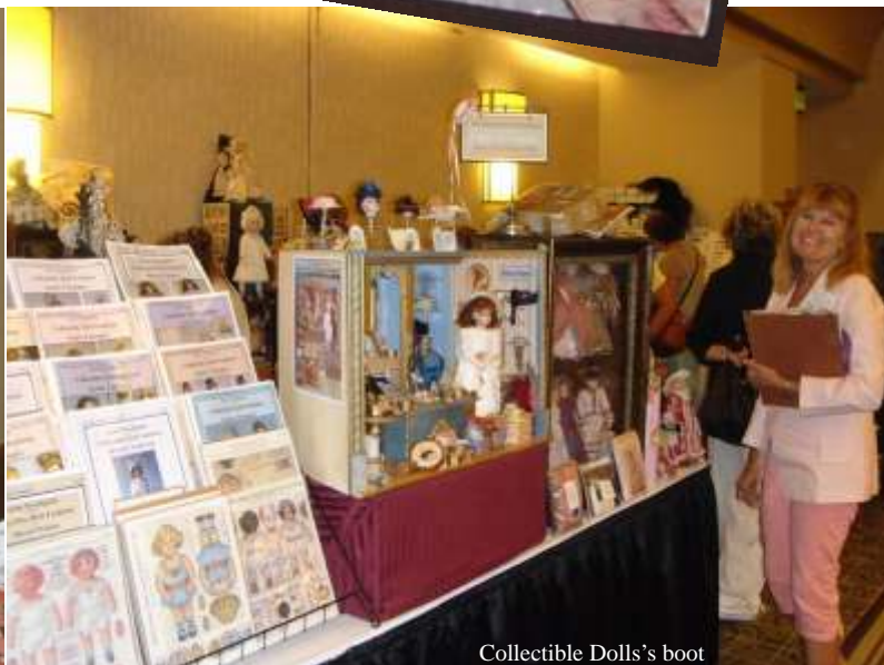
Collectible Dolls's boot