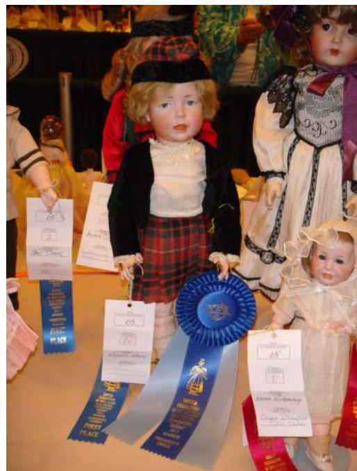
Other antique dolls in the competition and lots more ...