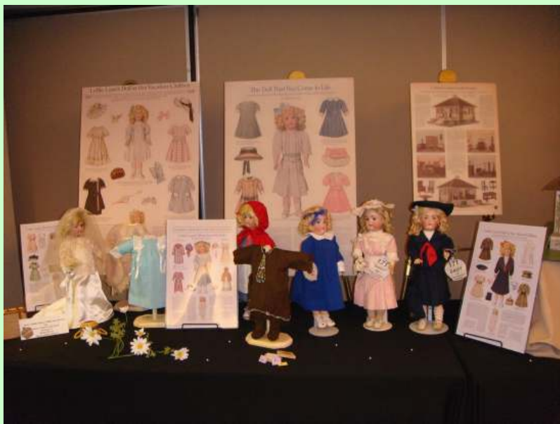
Kestner Daisy and lots of dress patterns

... and lots of other programs to enjoy.