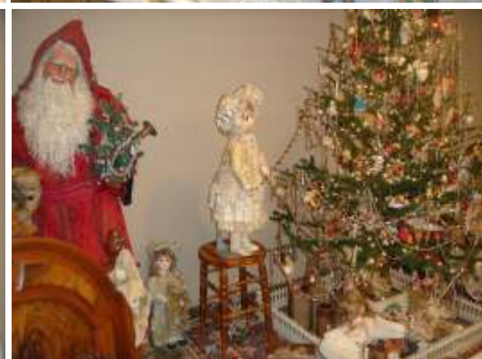
'Photographed at the United Federation of Doll Clubs, Inc. Annual Convention.'