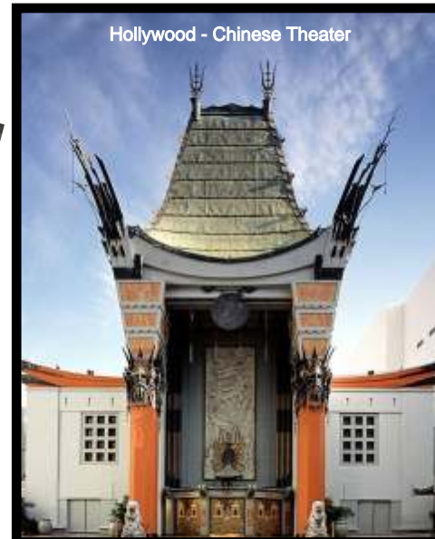
Hollywood - Chinese Theater